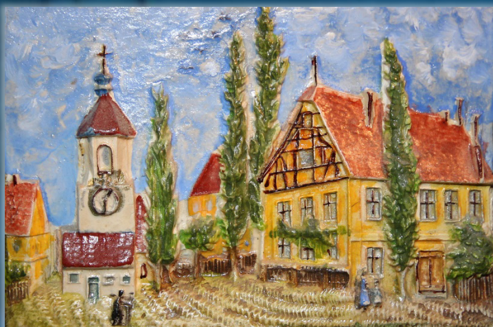
Neuendettelsau in the 19 th century