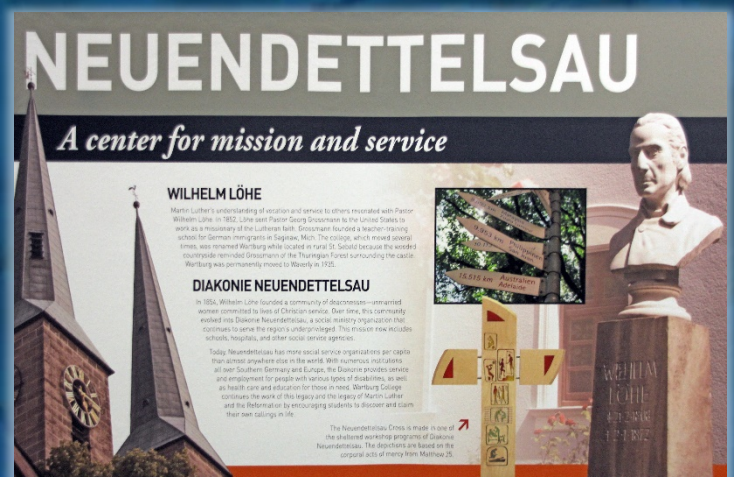
Neuendettelsau on a poster at Wartburg College, Waverly, Iowa